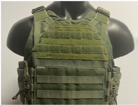
Prototype of the scalable body armor system.