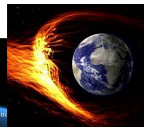
HEMP and GMD event examples