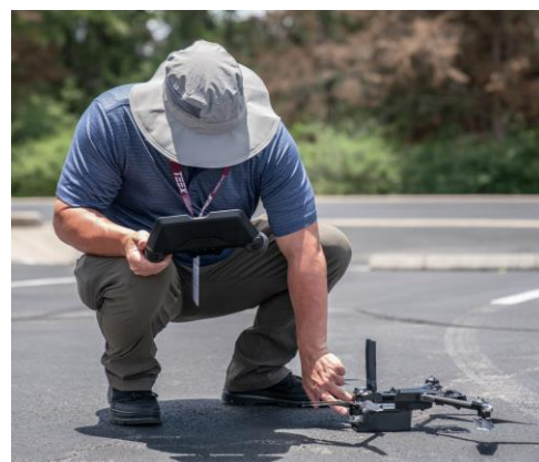
Figure 1. An evaluator preparing the Skydio X2D UAS for launch

Nine emergency responders, each subject matter experts (SMEs) on UAS for response, from Colorado, Florida, Michigan, New York, Oklahoma, Oregon, Texas, and Virginia assessed four platforms’ performance in simulated operational scenarios in full, low, and no-light conditions. This included preparing drones for deployment, flying them to gather information, changing batteries and redeploying, and conducting maintenance that responders would perform with routine use. Throughout these activities the SMEs assessed 13 evaluation criteria addressed four SAVER categories: capability, deployability, usability and maintainability: camera visual acuity, command and control link quality, covertness, customizable safety features, ease of use, flight duration, ground control station interface (GCS), GCS legibility, in-house maintenance, latency, portability, time to deploy, and time to redeploy. SMEs scored the criteria separately during day and night operations and found key differences that are explored in this report.