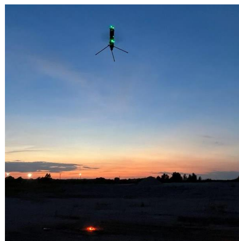
Figure 2. Ascent AeroSystems Spirit UAS launching in low-light conditions