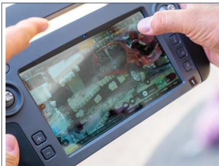
Figure 3. Camera images and GCS displays for the Spirit (upper left) and Skydio X2D (upper right) during night operations, as well as for the Spirit (lower left) and ANAFI USA GOV (lower right) during day operations.