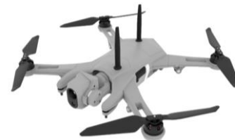
Teal Drones Teal 2 GSA Pricing: $15,073

Prices shown are rounded to the nearest whole dollar.