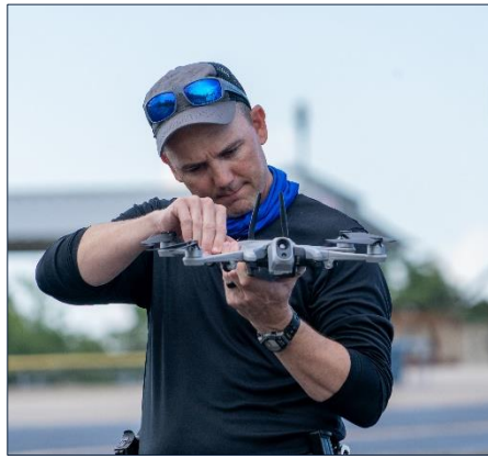
Figure 4. Evaluators preparing the Parrot ANAFI USA GOV (left) and Teal 2 (right) for deployment