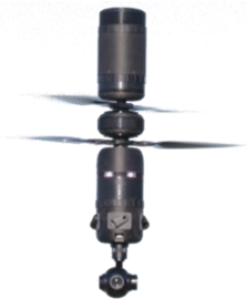
Ascent AeroSystems Spirit GSA Pricing: $56,195