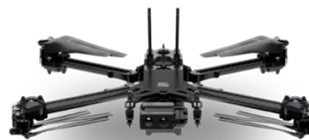
Skydio X2D GSA Pricing: $21,889