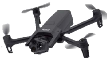
Parrot Drones ANAFI USA GOV GSA Pricing: $13,964