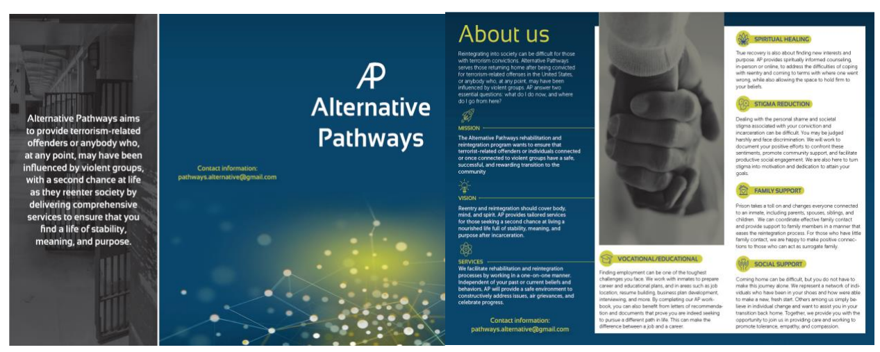
Figure 4: Alternative Pathways brochure

the United States, and their needs and conditions of supervised release varied on a case-by-case basis. Thus, producing a one-size-fits all resource guide would have been detrimental to the goal of securing volunteer participation of inmates in the program based on the premise that post-release services would be tailored to their individual case.