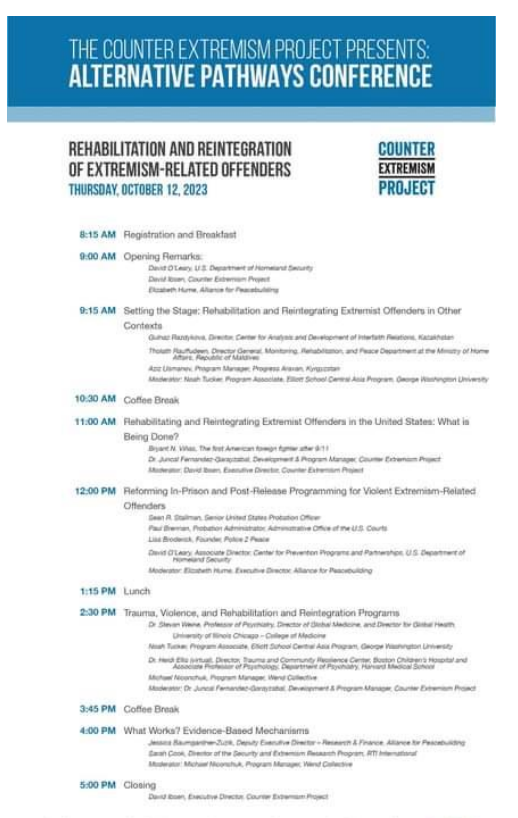
Figure 5: Alternative Pathways conference program

This does not imply, however, that the CEP team could not utilize the preliminary findings to create content for interactive workshop/training modalities for in-person and online participation. Aside from the dissemination efforts conducted under Objective 2, the team is currently preparing a series of online workshops that will be delivered as part of the 4R Network General Knowledge sessions (see Objective 1). Additionally, CEP also organized a full-day, in-person event to inform the broader public on the project and its preliminary results and inform policymakers and other relevant stakeholders on issues relevant to the rehabilitation and reintegration of extremist offenders both in the U.S. and elsewhere.