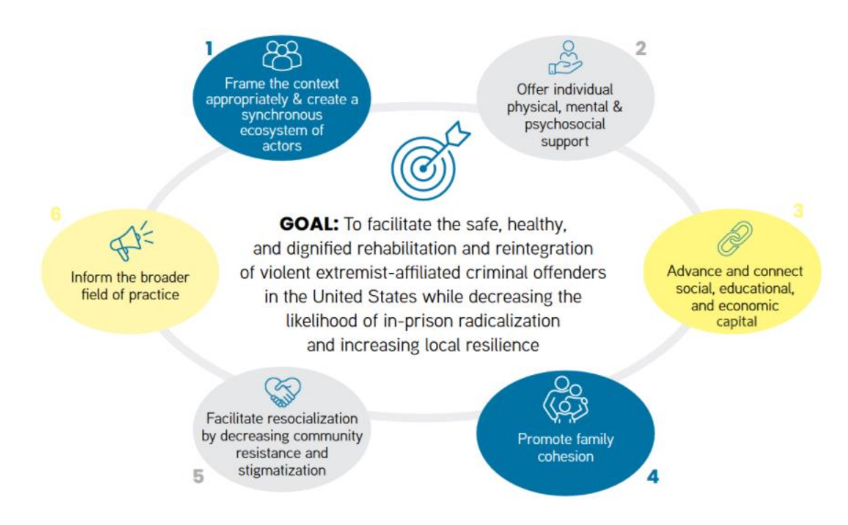
Figure 1: Alternative Pathways theory of change

The purpose of housing Alternative Pathways material under the 4R Network umbrella is two-fold. First, it served to accomplish one of the activities listed in the original implementation plan, i.e., creating a password protected website, transforming the theory of change file into web content, and hosting course and associated material online to facilitate future replication and trainings. Second, it would also help advance recidivism reduction programming for violent extremist offenders by allowing in-prison programs to operate in better conjunction with and support of post-release initiatives and professionals directly and indirectly working to support the rehabilitation and reintegration of extremist offenders.