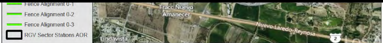
Project O-1 (RGC AOR)