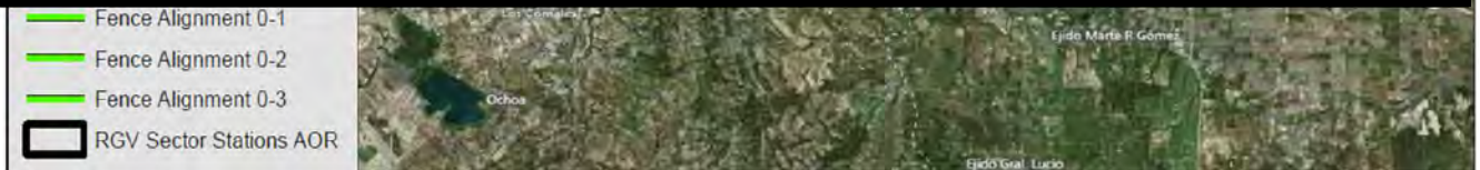
Projects O-1 through O-3 Overview