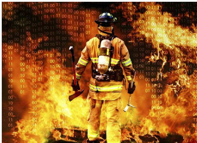
Figure 1: DA-E received a Data Impact Award from a panel of Silicon Valley CEOs for demonstrating advanced data analytic applications on a national scale to better understand fire incidents.

The Data Analytics Engine (DA-E) applies leading-edge computational data analytics research and development (R&D) techniques to enable user-focused, data-driven solutions for DHS missions. DA-E is the cross-cutting S&T resource for subject matter expertise and technical capabilities in data storage, security, computation, analysis, and visualization to the Homeland Security Enterprise (HSE), which includes DHS and its public and private sector partners.