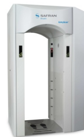
Figure 1. A Trace Explosives Detection Portal

Trace explosives detection portals are based on the premise that individuals who have handled explosives are likely to be contaminated with microscopic residues of explosives particles. It is by detecting these residues that individuals carrying concealed explosives are identified; portals of this type may also be capable of detecting narcotics. The subject standing in the portal is exposed to jets of air emitted by an array of nozzles arranged from floor to head level, which dislodge residual explosives particles from clothing, shoes, hair, and other body parts. These particles are carried by the flow of air within the portal to an ion mobility spectrometry (IMS) detector, a highly sensitive analytical device that is widely used at airports to screen baggage for traces of explosives and narcotics. When the IMS detector identifies that an explosives compound is present, the portal operator is automatically notified. Trace explosives detection portals are commercially available only as walk-through versions (Figure 1) for screening people, not as drive-through versions for screening vehicles.