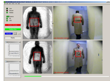
Figure 3. Active Millimeter Wave Detection Portal Images

At airports where imaging portals are in use, the U.S. Transportation Security Administration (TSA) gives passengers the option to be searched by the pat-down technique, although this option is not required under U.S. law. The TSA reports that 99 percent of passengers choose to be screened by an imaging portal rather than by pat-down. Most imaging portals now incorporate automated image processing software that reduces the level of anatomical detail in the image displayed to the portal operator. This software may automatically detect threat objects and mark their locations on the reduced resolution images seen by the portal operator (Figure 3).