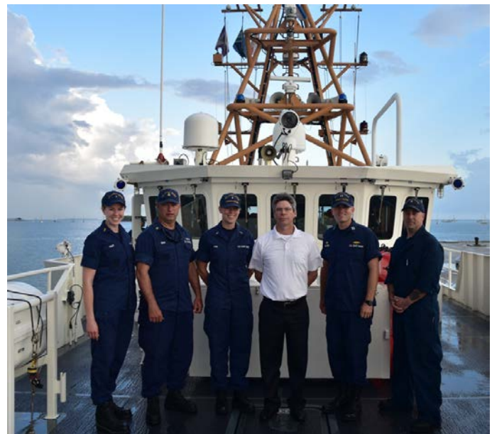
The S&T JIATF South Liaison Officer aboard a Coast Guard Sector Key West Fast Response Cutter on patrol in the Caribbean.