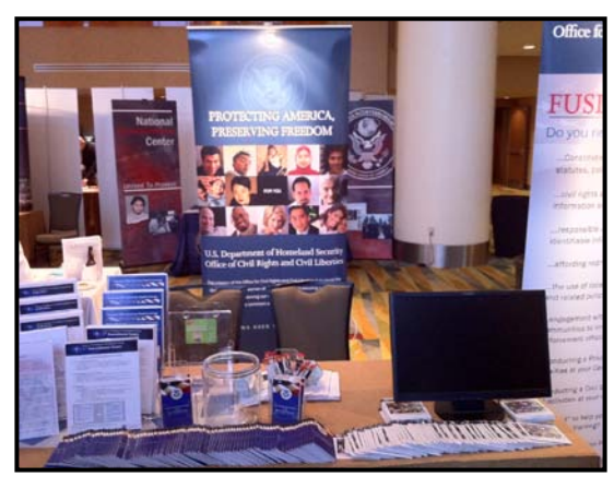
The CRCL booth at the National Fusion Center Conference

[National Fusion Center Conference, continued]