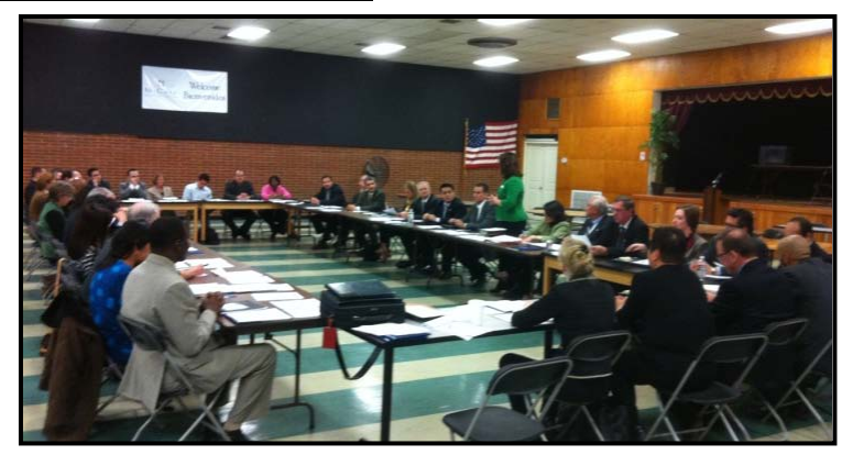
CRCL's inaugural Denver roundtable

As part of its continued expansion of community engagement and outreach, CRCL recently inaugurated a quarterly community engagement roundtable in Denver, Colorado. The meeting was attended by organizations and leaders representing Latino, Asian/Asian Pacific Islander, Middle Eastern, African, Jewish and Muslim communities. Several DHS components and other federal and state partners also attended the meeting, including representatives from TSA, ICE, CBP, USCIS, DOJ, FBI, and the Colorado Governor's Office of Homeland Security.