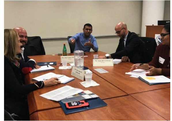
CRCL representative meets with IVLP French Delegation

CRCL recently met with civil society members and Department of Education officials from France as part of the International Visitor Leadership Program (IVLP). The meeting focused on sharing community engagement best practices to diminish the disparate discriminatory impact of government programs on young people. The French delegation also shared their experiences working with diverse migrant communities and challenges providing language access to young people with limited language proficiency. In particular they expressed interest in replicating CRCL’s roundtable format to enhance trust and relationship-building in their own country.