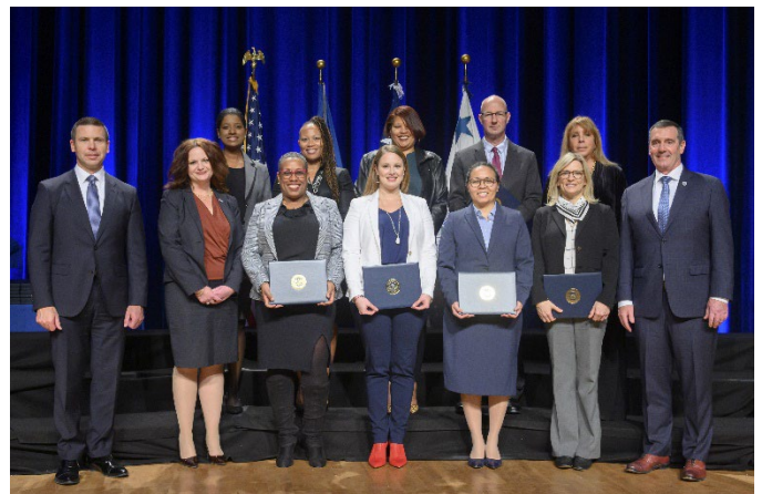
DHS Anti-Harassment Working Group awardees of Unity of Effort Award