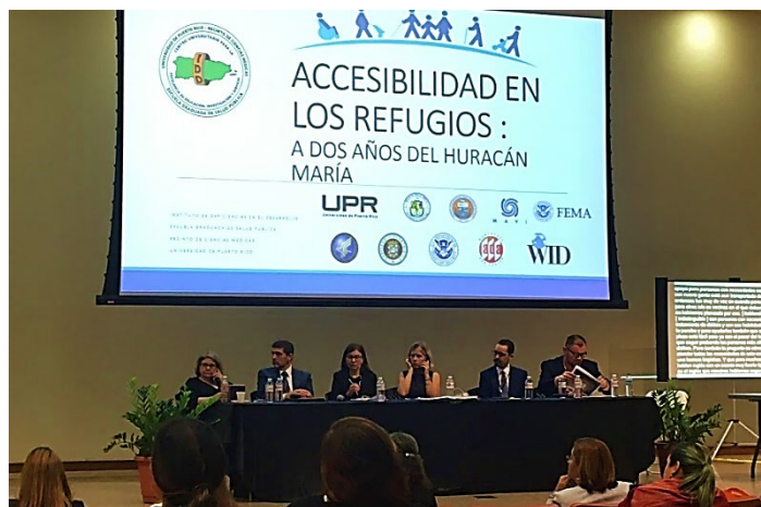
Panelists at the Disaster Symposium in San Juan, Puerto Rico

Symposium attendees included representatives from federal, territorial, and municipal agencies, as well as NGOs and emergency management personnel among others.